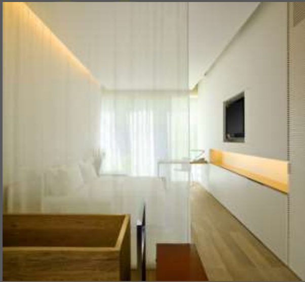
Studio 45(43 units)