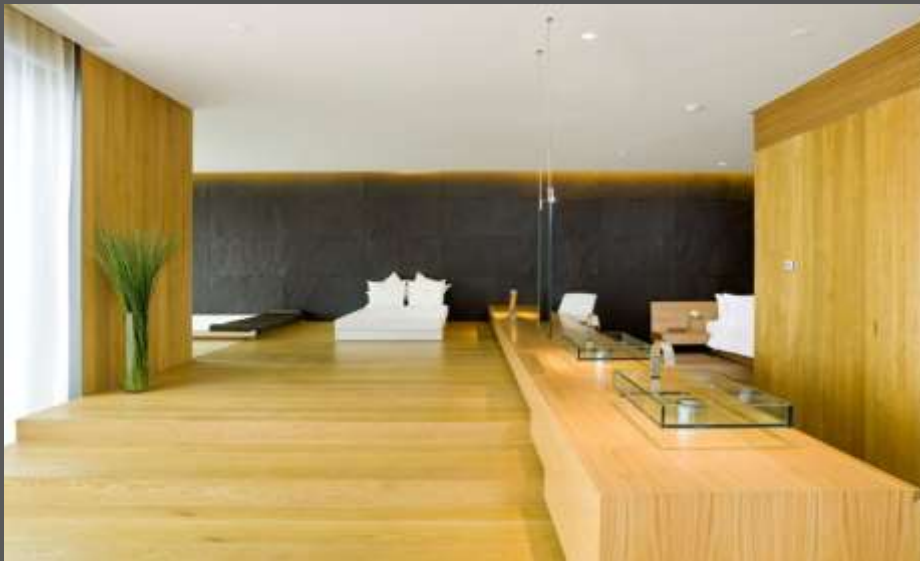
Studio 115(2 units)