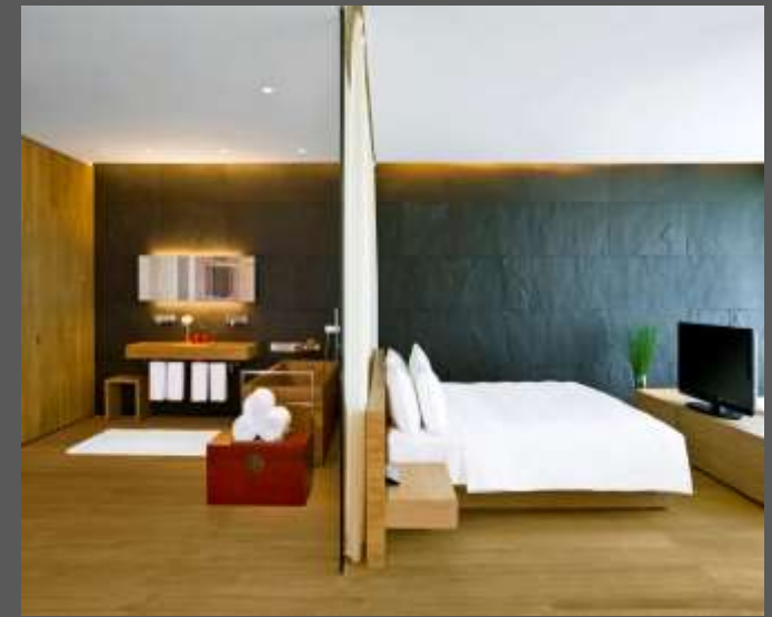
Studio 95(7 units)