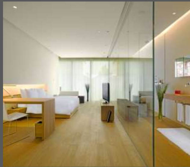
Studio 70(46 units)