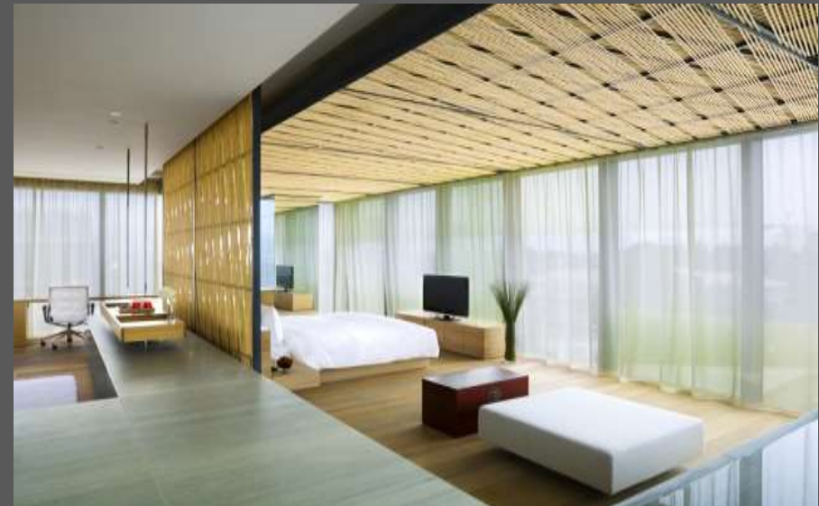
Penthouse (1 unit)