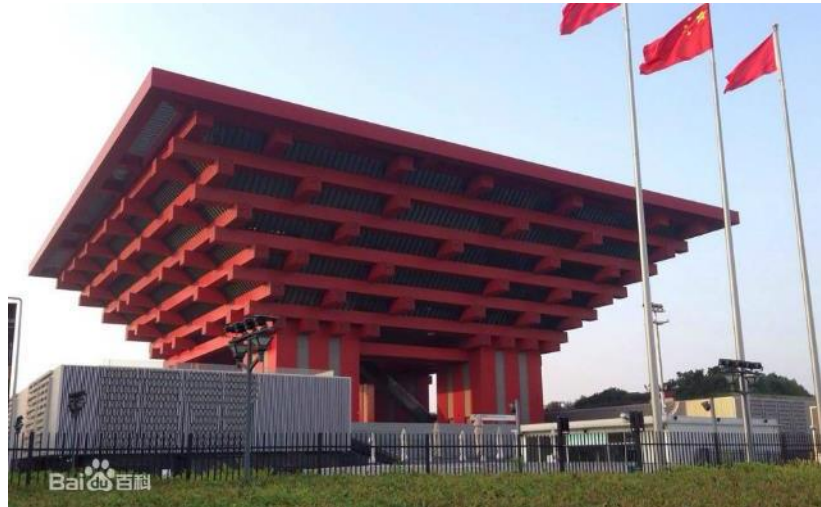
China Arts Museum