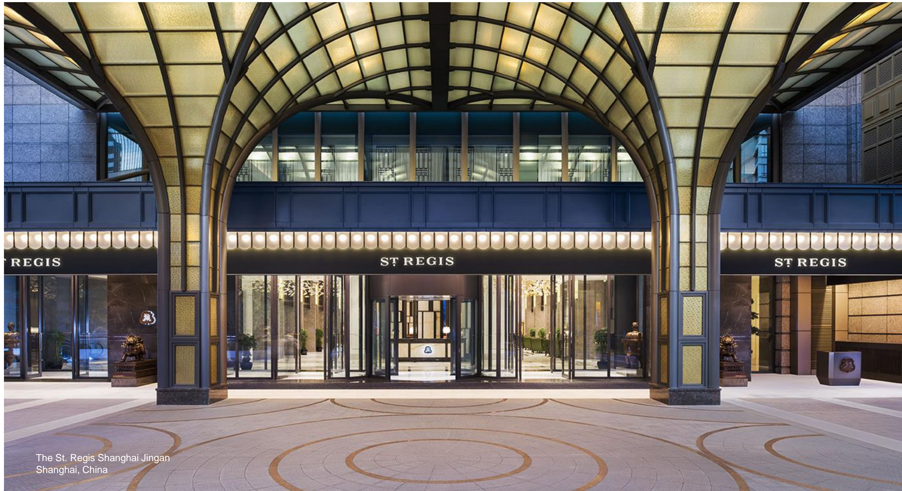
The St. Regis Shanghai Jingan Shanghai, China