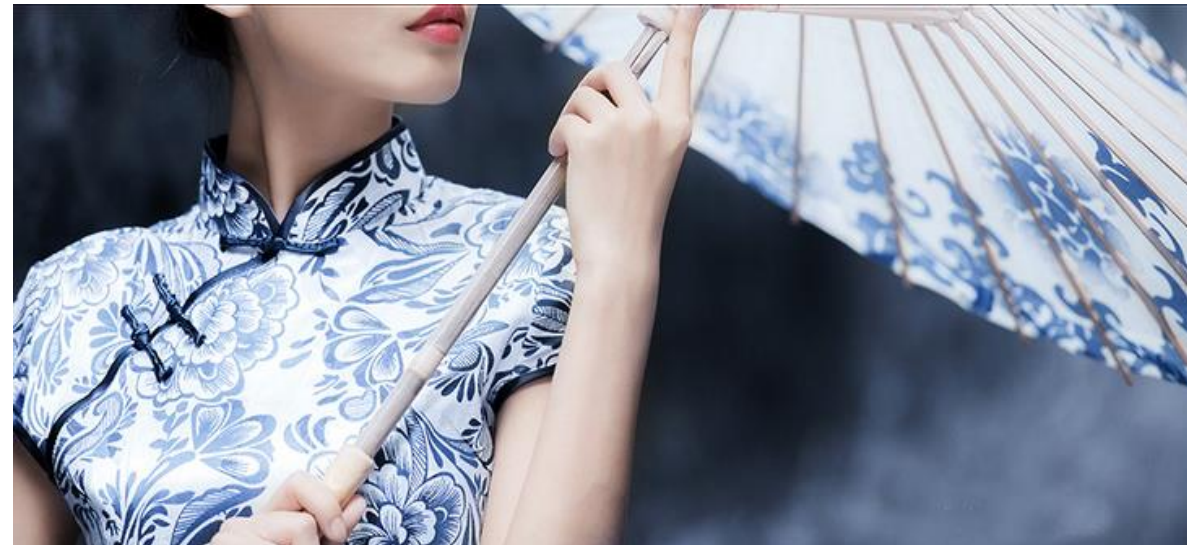
Chinese Traditional Qipao