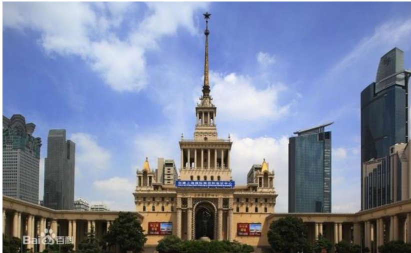
Shanghai Exhibition Center