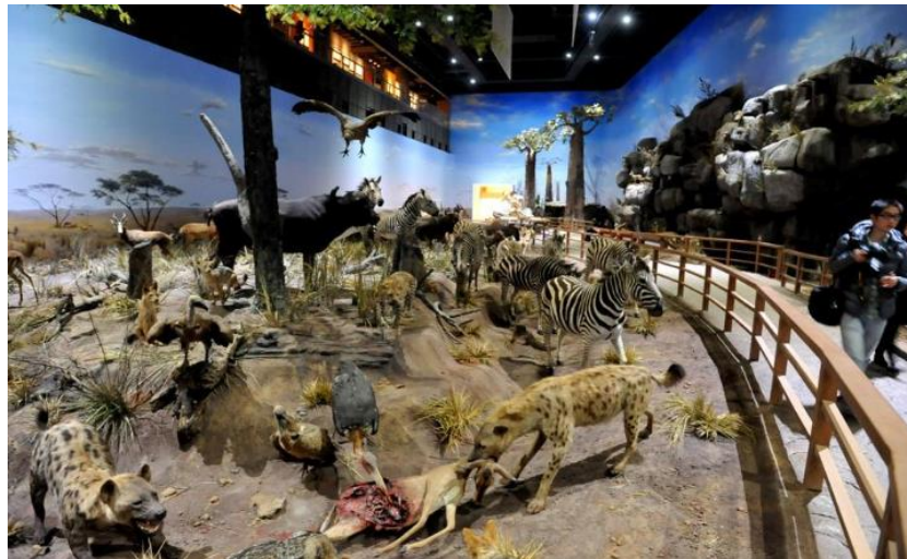
Shanghai Natural History Museum