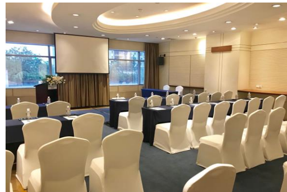
唐厅 Tong Room