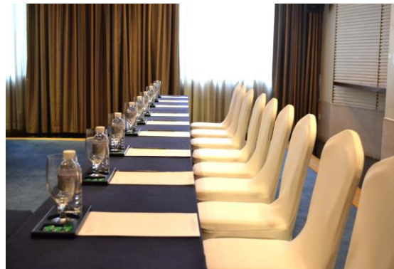
宋厅 Song Room