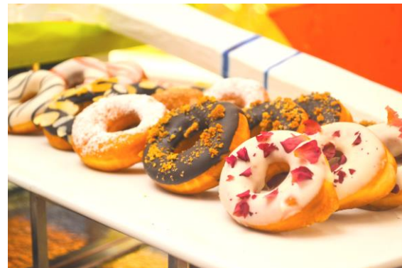
会议茶歇 Tea Break