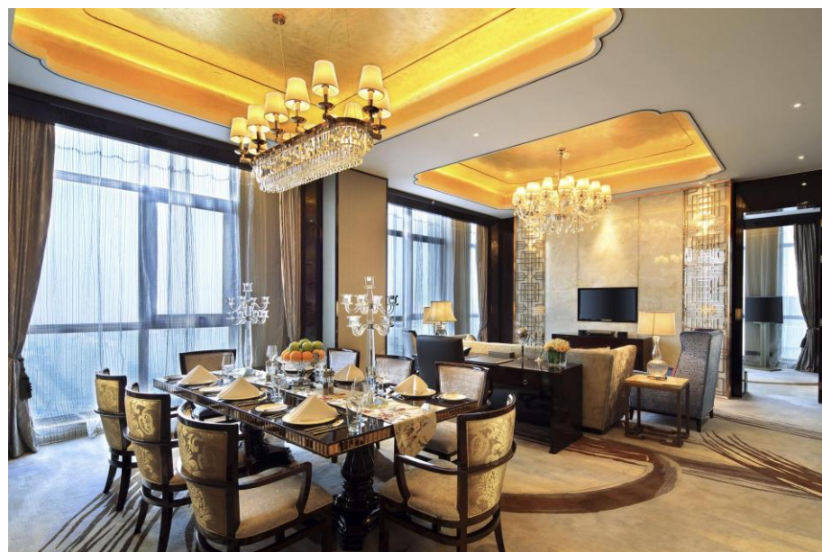
董事套房 Chairman Suite