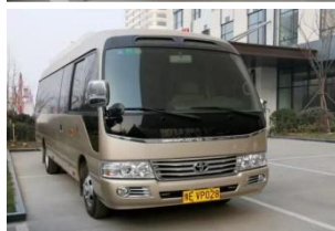
安阳富力万达嘉华酒店豪车服务价格表（人民币） Wanda Realm Anyang Limousine Service Price Form(RMB)